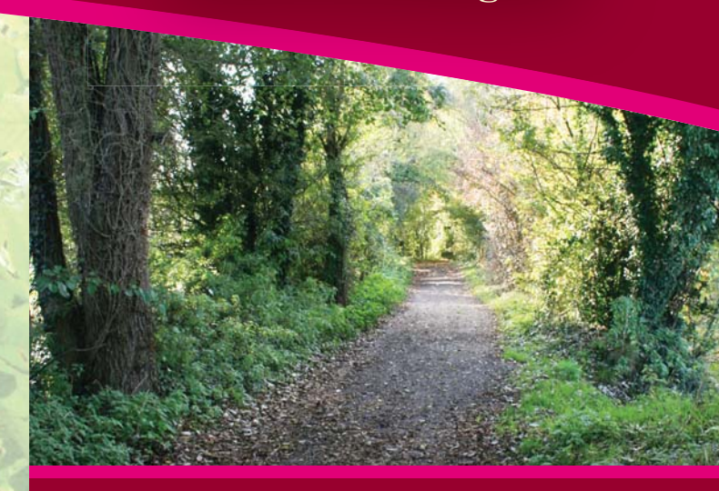
Film location for Miss Marple, Poirot and Jane Austen's Emma