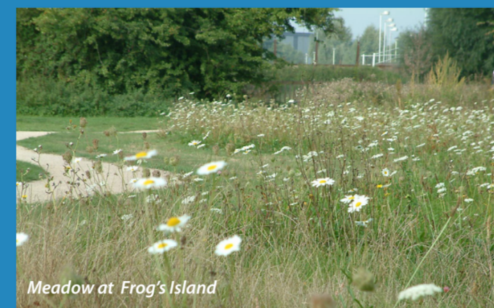
Meadow at Frog's Island

The rivers, riverbanks, trees, orchards, wetland, meadows, park areas, playing fields, ponds and hedges of the Green Corridor demand different kinds of management; management which balances wildlife conservation with maintaining good, safe access and space for people to enjoy.