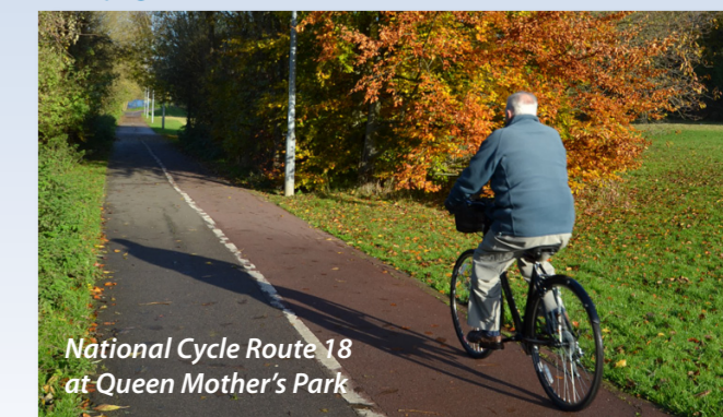
National Cycle Route 18 at Queen Mother's Park

For further information on cycle routes see contacts on back page.