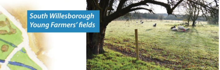
South Willesborough Young Farmers' fields

Amongst the houses you will also come across a delightful piece of country life. A public footpath runs right through the middle of fields where you might see cattle, sheep, hens and other animals. All managed by members and volunteers of The SWAN Young Farmers Club, and a reminder of how rural it was here not so long ago.