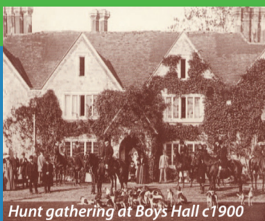
Hunt gathering at Boys Hall c1900

From the manors of Buxford in the west to Boys Hall Moat in the east, the Green Corridor is rich in heritage.