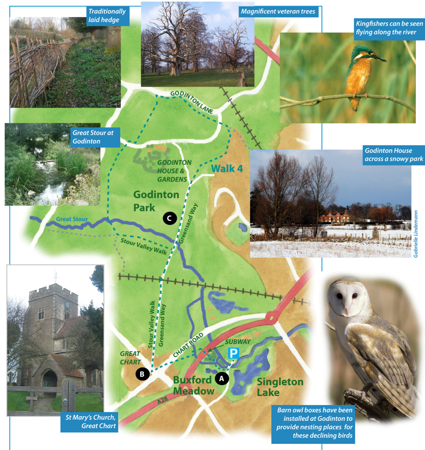
Traditionally laid hedge

For opening times, entry fees and events www.godintonhouse.co.uk